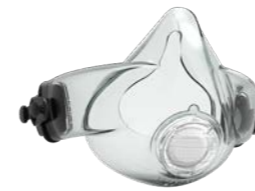
Half Mask (includes head harness)

CST1034 - Small CST1035 - Medium CST1036 - Large