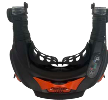
CleanSpace ULTRA CST1011

Power unit* includes neck supports, charger & carry bag