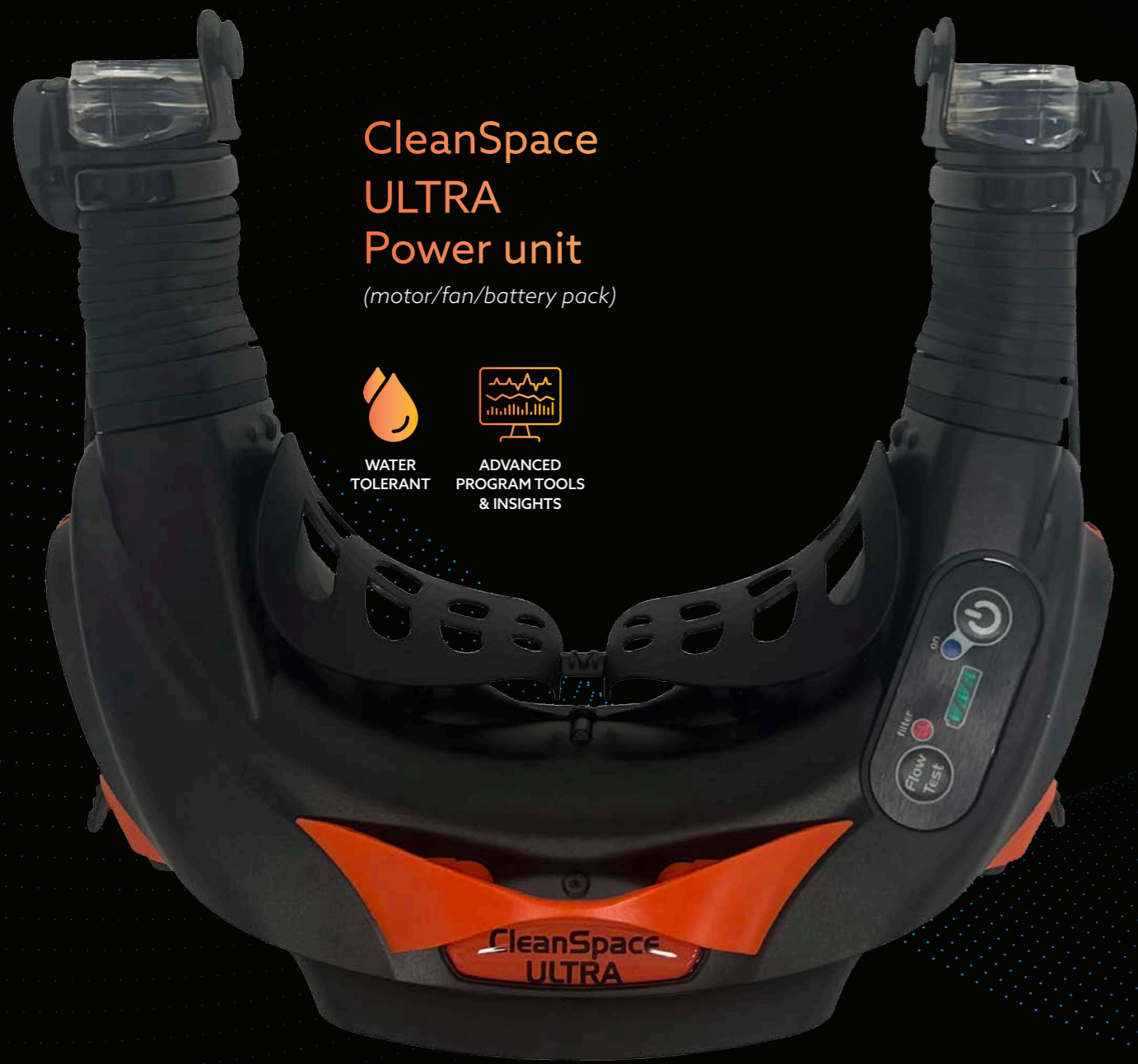
CleanSpace ULTRA Power unit (motor/fan/battery pack)