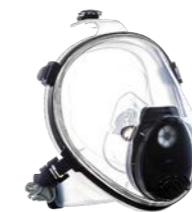
Full Face Mask

CST1034 - Small CST1035 - Medium CST1036 - Large