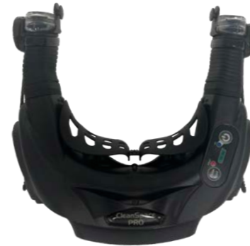
CleanSpace PRO CST1001

Power unit* includes neck supports, charger & carry bag *excludes mask and filter