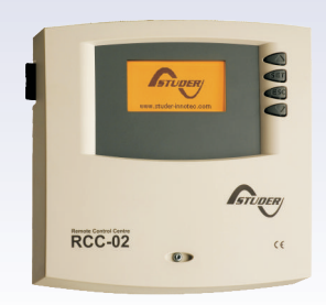
RCC -02 Remote control and programming center (Wall mounted)